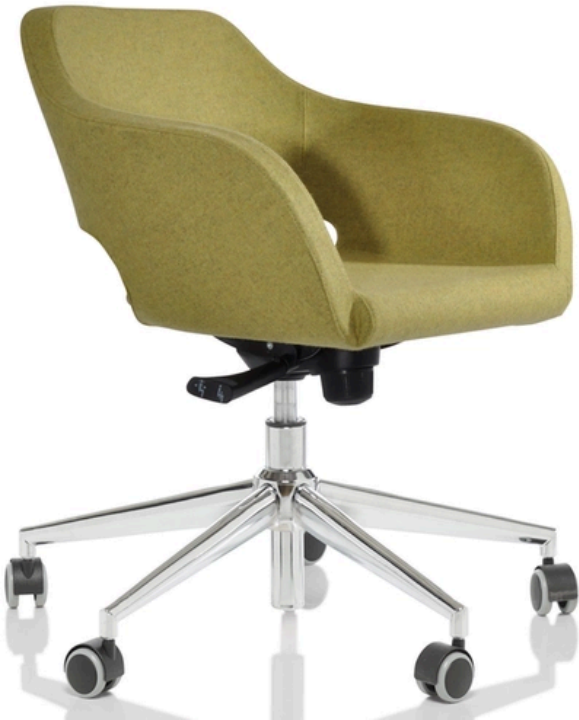
THE PHOTO MAY INCLUDE OPTIONAL

The Aria chair is designed to offer the perfect balance between aesthetics and functionality, making it ideal for furnishing waiting areas, meeting rooms, and contemporary workspaces. The soft, enveloping lines of the Aria chair provide not only a pleasing aesthetic but also exceptional comfort, thanks to its ergonomic structure and high-quality materials. Despite its minimal thickness, the seat ensures optimal support, making it perfect for extended use. The collection stands out for offering two different base options: a conical steel base, which gives a modern and industrial look, and a five-star base, synonymous with stability and practicality, ideal for operational settings. Whether used to furnish welcoming waiting areas or in dynamic spaces such as meeting rooms, Aria stands out as a sophisticated and functional choice, enriching any environment with class and understated elegance.