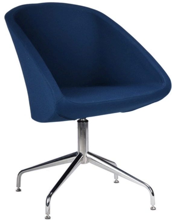
THE PHOTO MAY INCLUDE OPTIONAL

Considering the maximum weight recommended by ITALIAN SEDIOLITI. For warranty conditions, please refer to the general sales conditions at the beginning of the list.