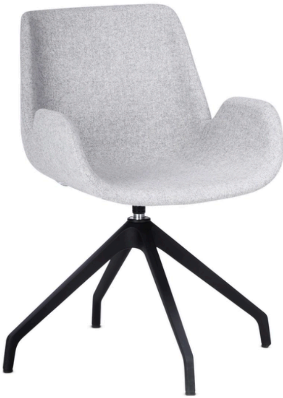
THE PHOTO MAY INCLUDE OPTIONAL

The B2 chair stands out for its ability to adapt to different settings thanks to three types of bases: wooden, conical steel, or five-star. These variations offer versatile and stylistically diverse solutions, ideal for elegantly and functionally furnishing waiting areas and welcoming meeting rooms. The soft and compact lines of the B2 chair, combined with a minimalist design with reduced thickness, ensure high comfort without compromise. Every detail has been carefully designed to create a refined seating collection, perfect for professional spaces that require both style and practicality. B2 represents a sophisticated choice, capable of combining modern aesthetics and comfort in any environment.