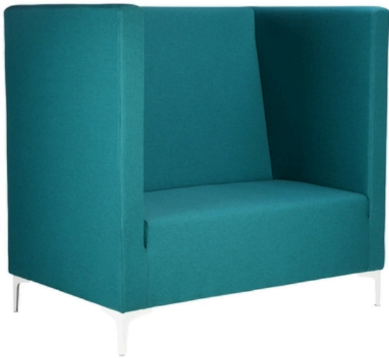
THE PHOTO MAY INCLUDE OPTIONAL

The Cubone sofa is designed to offer a high level of comfort and create enclosed spaces that ensure relaxation and concentration. The surrounding walls provide excellent sound insulation, fostering a calm atmosphere and a pleasant sense of tranquility. Thanks to its refined design and the use of high-quality materials, these sofas not only enhance users' well-being but also enrich common areas with a touch of elegance and functionality. Perfect for those seeking furnishing solutions that combine comfort, privacy, and style, they are the ideal choice for creating dedicated spaces for relaxation, focus, or private conversations in public and professional environments.