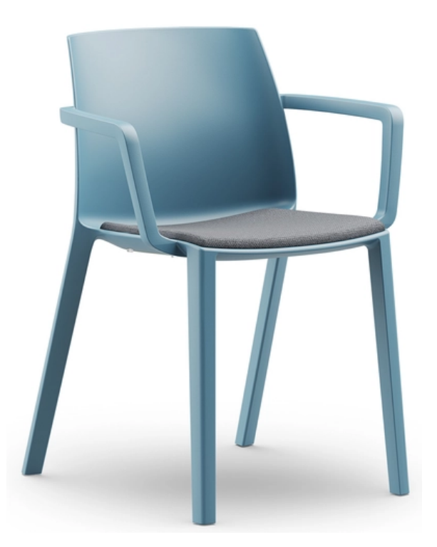
THE PHOTO MAY INCLUDE OPTIONAL

Considering the maximum weight recommended by ITALIAN SEDIOLITI. For warranty conditions, please refer to the general sales conditions at the beginning of the list.