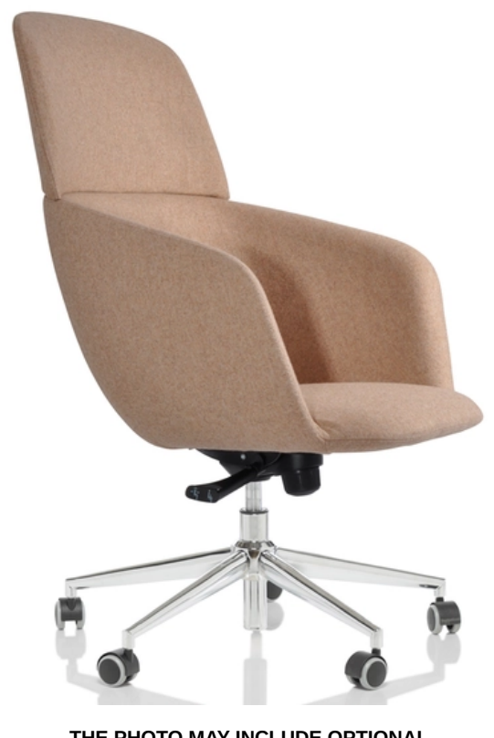
THE PHOTO MAY INCLUDE OPTIONAL

Every detail has been carefully crafted to create these elegant and functional seats, distinguished by their minimal thickness, which does not compromise maximum comfort, ensuring a pleasant seating experience even for prolonged periods. The two types of bases conical steel and five-star – allow the Egg chair to furnish waiting areas and meeting rooms in a comfortable and welcoming way. The conical steel base gives a modern and sophisticated look, making it perfect for contemporary and design-oriented spaces. The five-star base offers superior stability and greater mobility, making it ideal for dynamic and flexible environments.