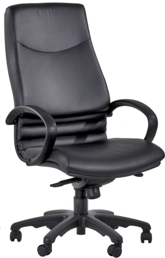
THE PHOTO MAY INCLUDE OPTIONALS

The welcoming Perfecto chair stands out for its clean and well-defined shapes, designed to offer superior comfort without compromising on a modern and refined design. Its linear and essential style makes it a versatile furnishing element, capable of enhancing any space with understated elegance, whether in executive offices or waiting and reception areas. The attention to detail and the selection of high-quality materials highlight its beauty and prestige, giving it an exclusive and professional appearance. Available in two versions – a high-back model for presidential use and a mid-back version, perfect for welcoming guests – this chair offers a perfect balance between comfort and style. The distinctive character of the chair is also expressed through a range of high-quality upholstery options, including elegant fabrics, faux leather, and premium leather. Each finish has been carefully selected to enhance its sleek design, ensuring a comfortable and flawless seating experience in every aspect.