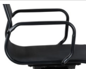
BR WH NR Black painted steel armrests