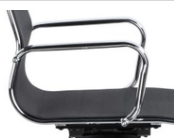
BR WH CR Chrome-plated steel armrests