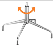
BA 4P CR TOR Chrome-plated steel base with return column and feet, 680mm diameter. For PFF version